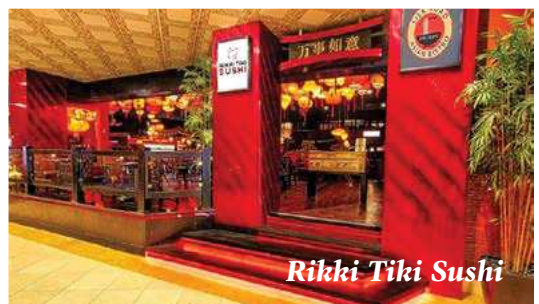
Rikki Tiki Sushi

Westgate features some of the best eateries in the city from their famous Benihana Village to the Edge Steakhouse, Rikki Tiki Sushi, Sid's Cafe and Fresco Italiana! There really is something for everyone's appetite in this beautiful casino.